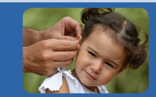
Ask for help if wearing hearing aids is challenging for your child.