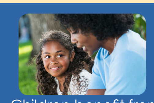
Children benefit from language that is a little more complex than what they use. Don't simplify what you say too much.