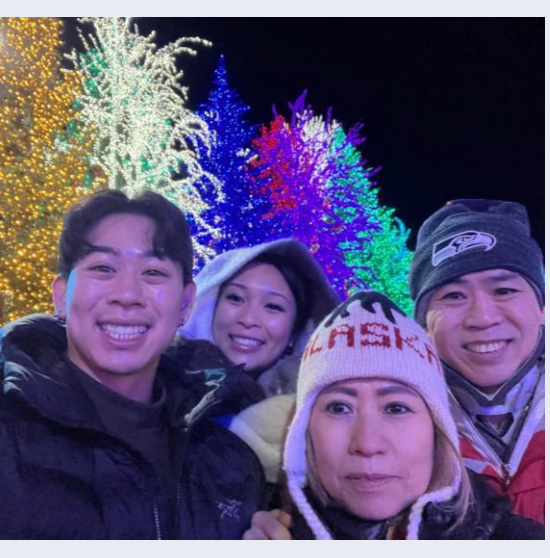
Family during Christmas:)