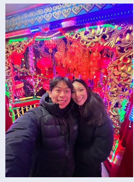
Chinese New Year!